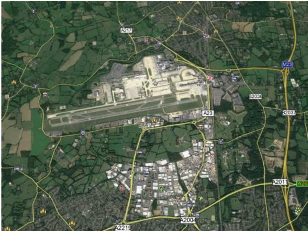
Figure 2: Aerial view of Gatwick Airport